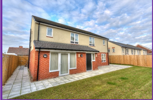
October 2019: Clusters – Shakespeare Drive, Dinnington (Council build)

• five homes for Council rent (one leased internally)